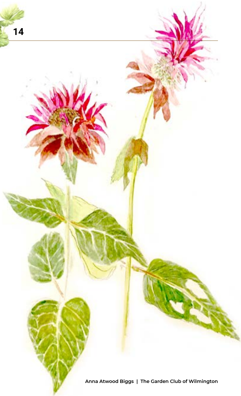
Anna Atwood Biggs | The Garden Club of Wilmington

The following materials are not permitted to be used in the design: balloons, beads, confetti, glitter, sparkles, sequins, soil, turf.