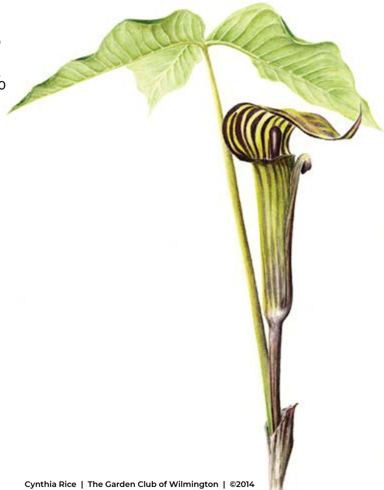
Cynthia Rice | The Garden Club of Wilmington | ©2014